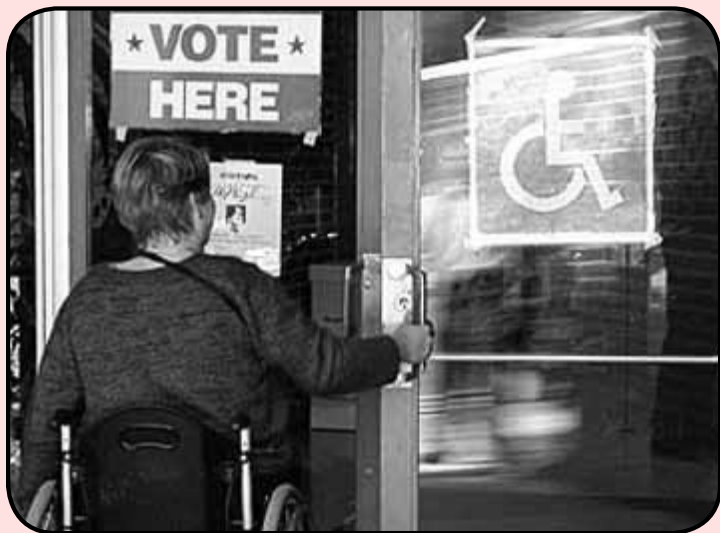
Your voice needs to be heard. Don't let New Hampshire's Voter ID bill stop you from voting!

If you do not have an approved photo ID, you can get a free photo ID for voting. To get a free voter ID, start at your Town Clerk's office. The clerk will have you sign an affidavit that you do not have a valid photo ID, verify that you are on the voter checklist, and give you a voucher. Take the voucher to any Division of Motor Vehicles (DMV) office and get your free voter ID.